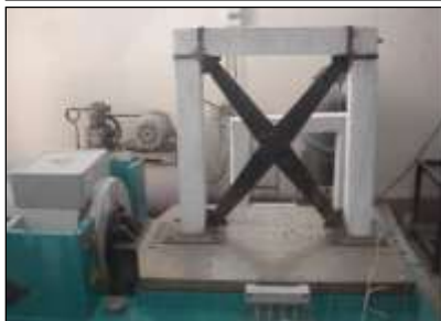
Frame engineered infill wall