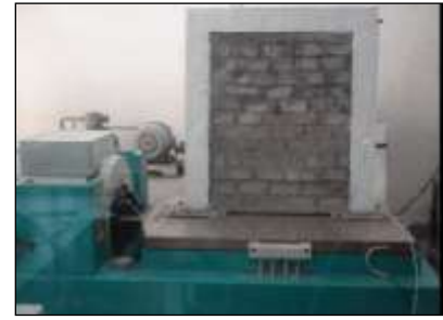
Infilled frame with Opening