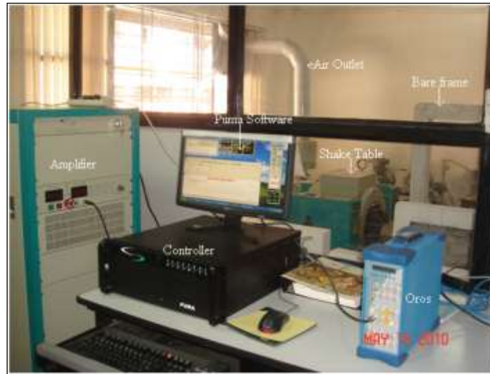
Figure.1 Laboratory arrangement of shaking table experiments showing various components of instrumentation.