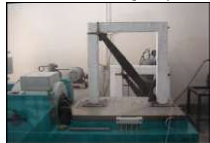
Double Braced Frame